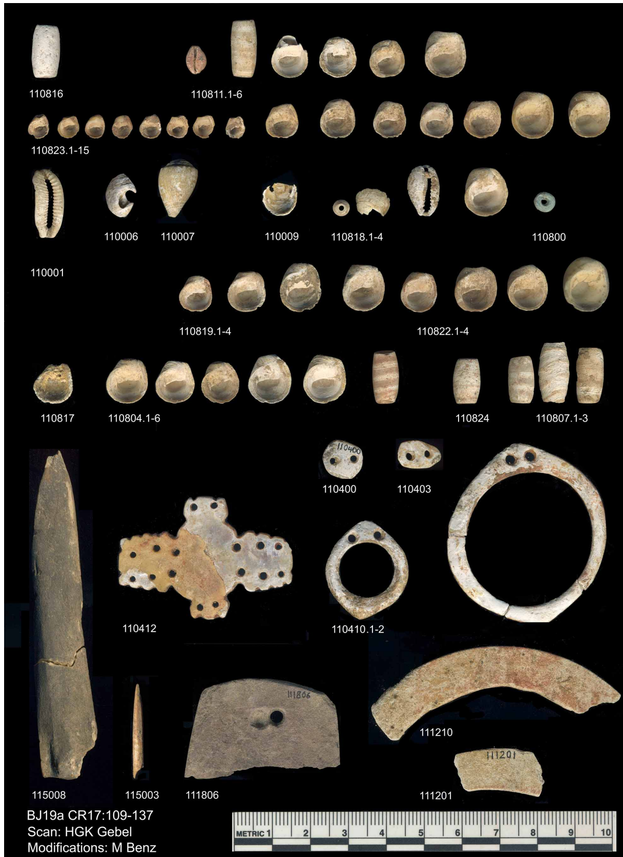
Fig. 4. Ba'ja 2019a: Remains of grave goods attested in the basement room's CR17 collective burials.