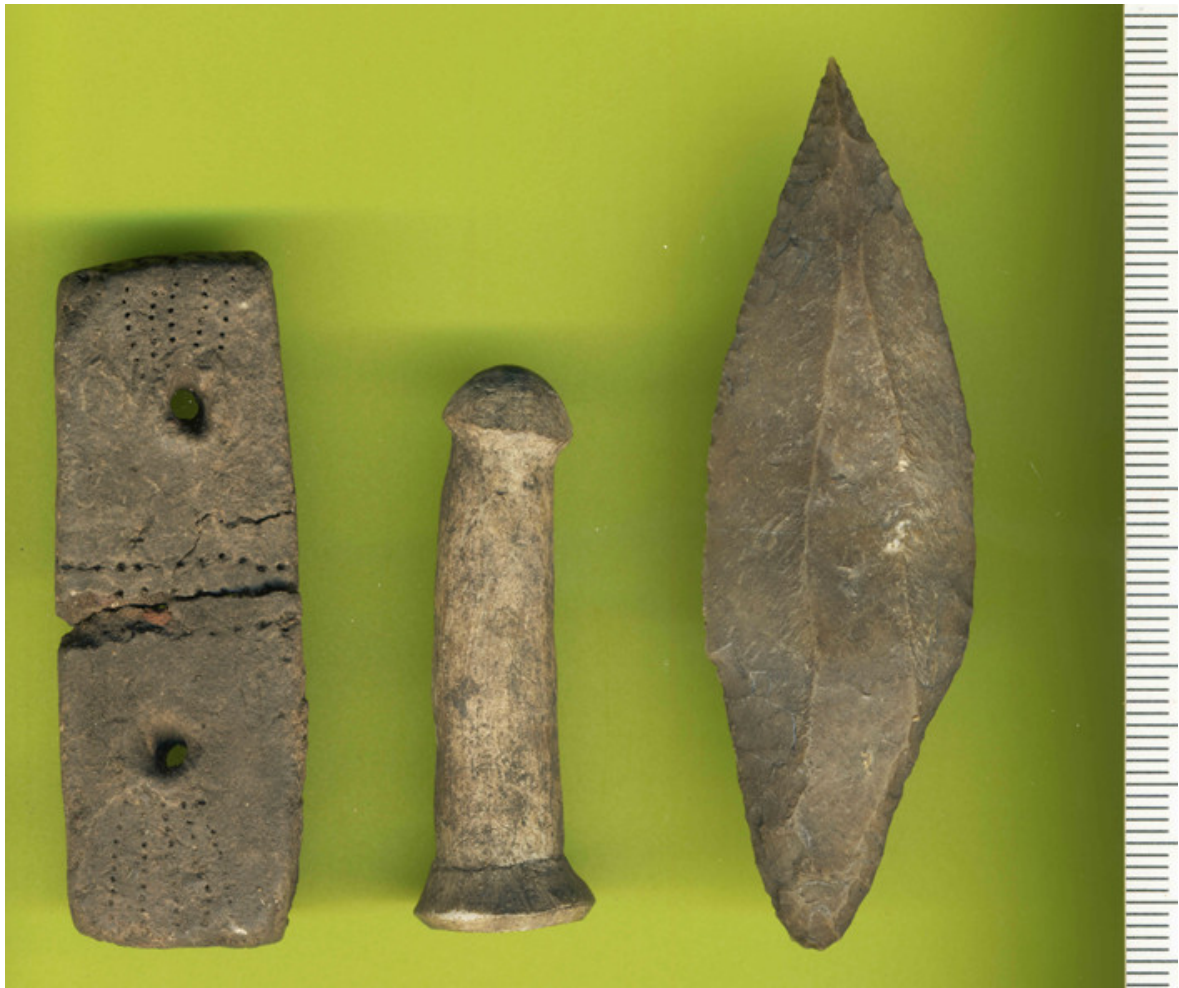
Fig. 6. Ba'ja 2019a: Hoard items from beneath a trilith and crashed vessel installation and above a child burial: large Byblos Point, small phallus, and a decorated clay cuboid.