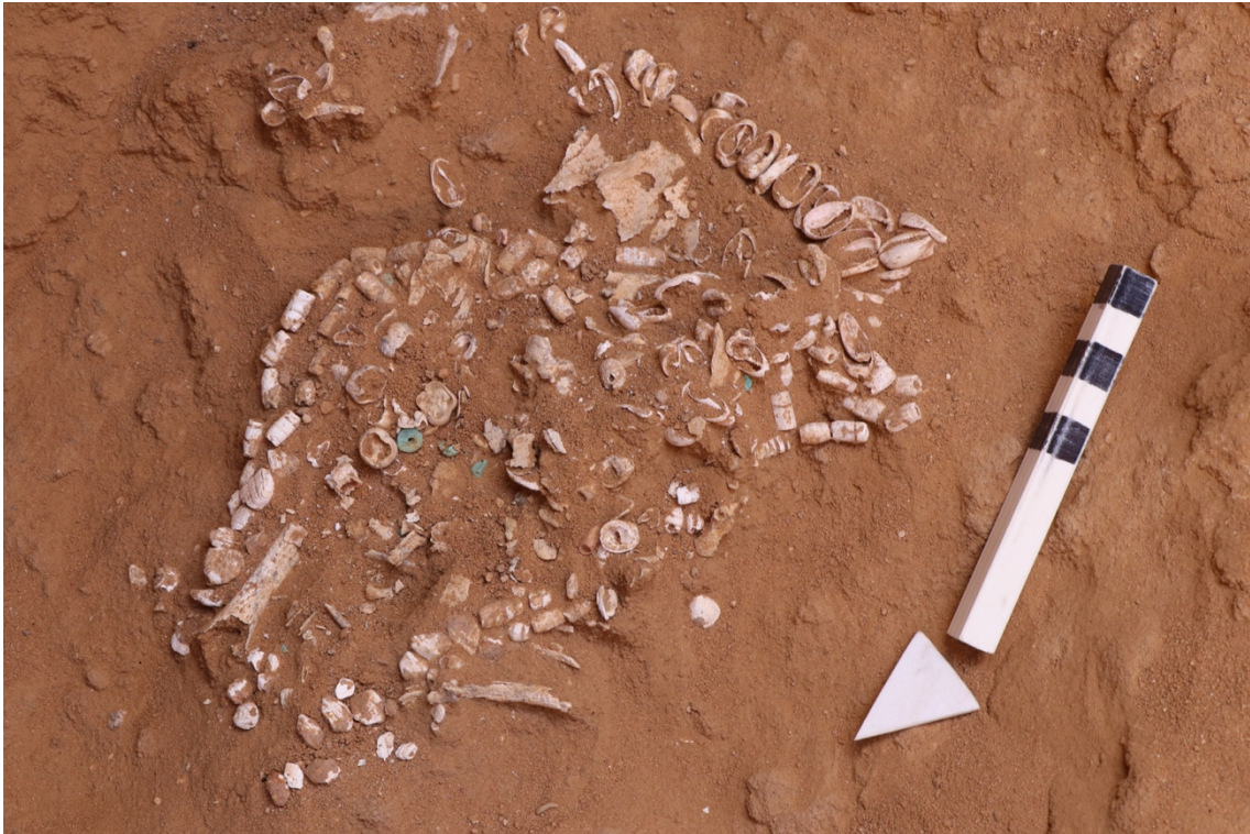
Fig. 2. Ba'ja 2019 a: An outstanding double child burial was decorated with more than 1000 coloured beads and shells of various local and exotic materials. The beads were possibly sewn on some kind of cloth.