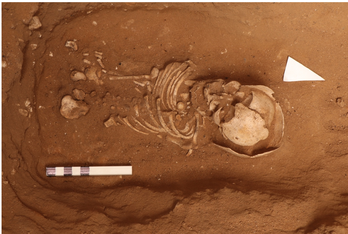
Fig. 1. Ba'ja 2019a: Besides at least eleven children in a collective tomb, nine inhumations of children in single or double burials were uncovered in the basements of rooms in Area C during the 2019 spring excavations.

DoA Representative: Abdallah Rawashdeh, Ma'an Office of DoA