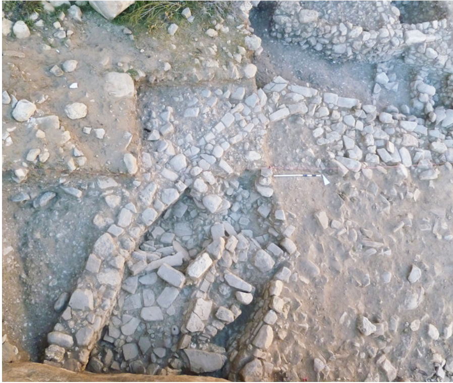
Fig. 5. Ba'ja 2019a: Bird's-eye view of Area G's Test Units 9a-c showing the downslope curvilinear wall with an upslope lane, room fills and stone-paved room with in situ items (FPPNB/PPNC).